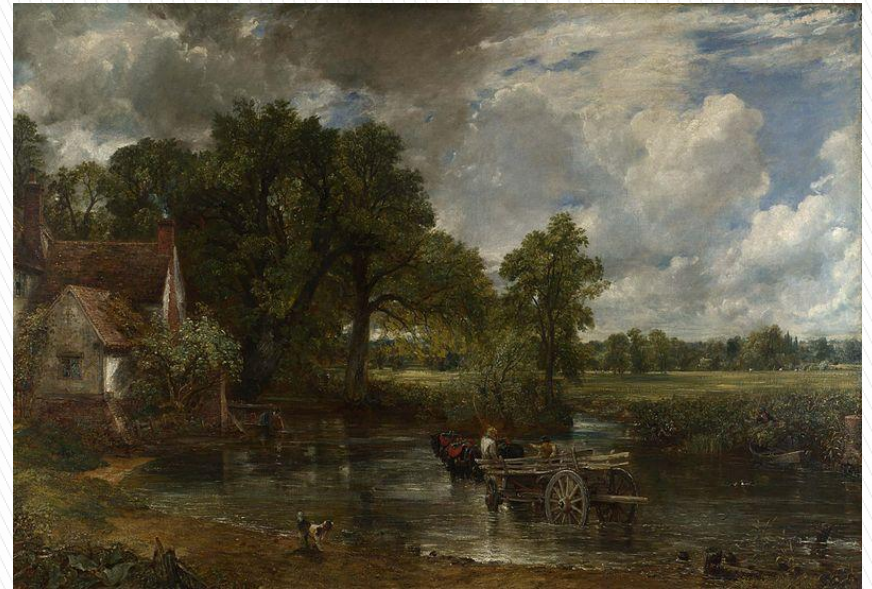
John Constable, 'The Hay Wain'