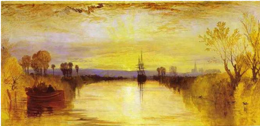
Turner 'Chichester Canal' (1828)